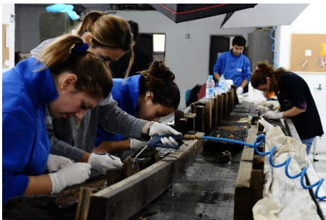
Cleaning of waterlogged ship timbers

Polyethylene glycol (PEG) impregnation techniques Freeze-drying processes Wood species identification, degradation assessment, and preservation strategies