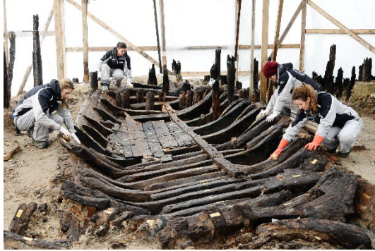
Excavations at Yenikapı Shipwreck 34

Discovered during the Marmaray–Metro excavations carried out between 2004 and 2013 in the historic peninsula of Istanbul, at the site of the ancient Theodosian Harbour, the Yenikapı Shipwrecks constitute the world's largest collection of medieval shipwrecks, with 37 ancient vessels dated between the 5th and 11th centuries AD. These extraordinary finds shed light on Istanbul's maritime past and the trade networks of the Byzantine era.